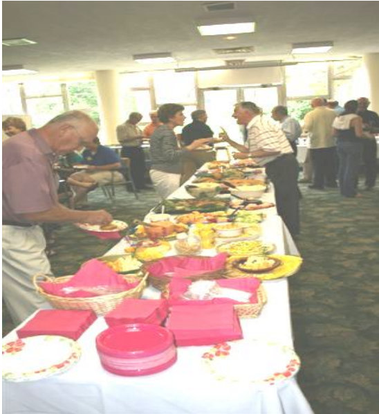
Pittsburgh Associates Enjoying Each Other's Company

The Pittsburgh Passionist Associates have been busy over these past few months! We had a wonderful Christmas Party complete with a visit from Santa.